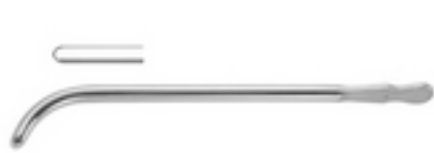
SI-118-101 Van Buren Urethral Sound