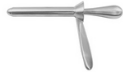
SI-103-124 Kelly Proctoscope Fig. 3 Diameter - Working Length 22 mm Ø - 140 mm